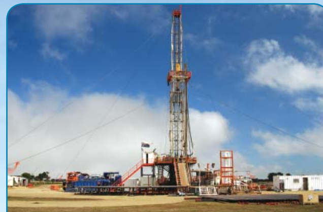
Drilling of the CRC-I Well, the site of injection for Australia's first demonstration of geosequestration.